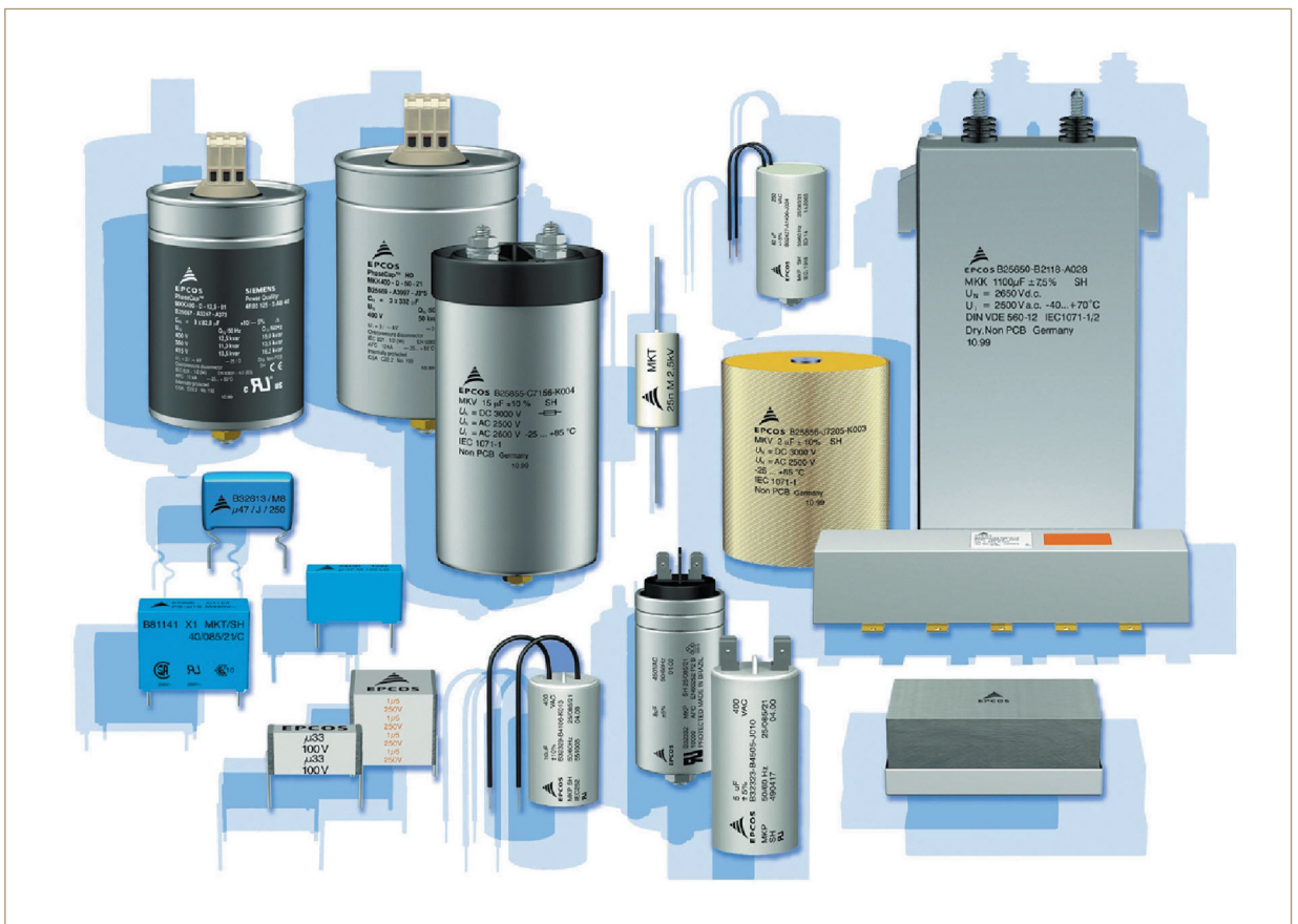
Figure 1: Overview of power capacitor concepts

Impurities of the PP film are annealed by