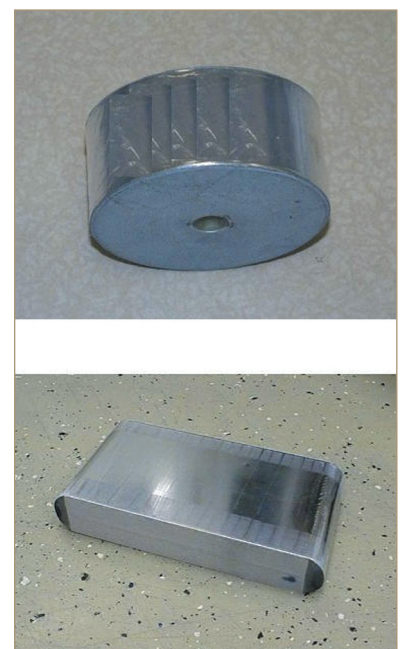
Figure 3: Different types of polypropylene windings

aging are applied to simulate and confirm the drop of capacity. In advanced and fast switching IGBT converters especially, the DC link current frequency spectrum must be well considered during the layout of the film capacitor. The main switching frequency, as well as high frequency fractions in the frequency spectrum, can cause strong heating of the capacitor, and if the switching frequency of the system is too close to the resonant frequency of the DC link, an internal busbar set-up is needed to avoid overloading the component. The aging process of a film capacitor can be approximated by a first order chemical reaction and may be described with an Arrhenius equation [1]. Basically, the electrical field strength combined with the temperature of the capacitor are the driving factors for the aging process. While the field strength is