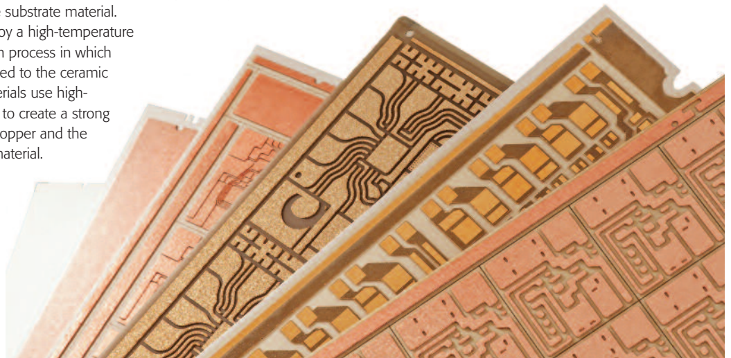
Figure 1: The four curamik ceramic circuit materials provide different levels of thermal dissipation

These ceramic circuit materials are manufactured by means of tightly controlled processes, resulting in consistent electrical and mechanical behavior from lot to lot and across the