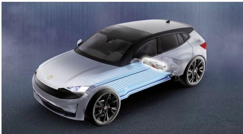
Figure 1. Typical BMS and battery in an EV

Hardware-in-the-loop solutions provide a safe way to simulate the two-pole behavior of battery cells, modules or packs. The output of real, high-precision voltages